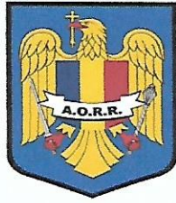
Romanian Reserve Officers Association (AORR)