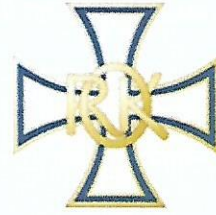
Estonian Reserve Officers Association (EROK)